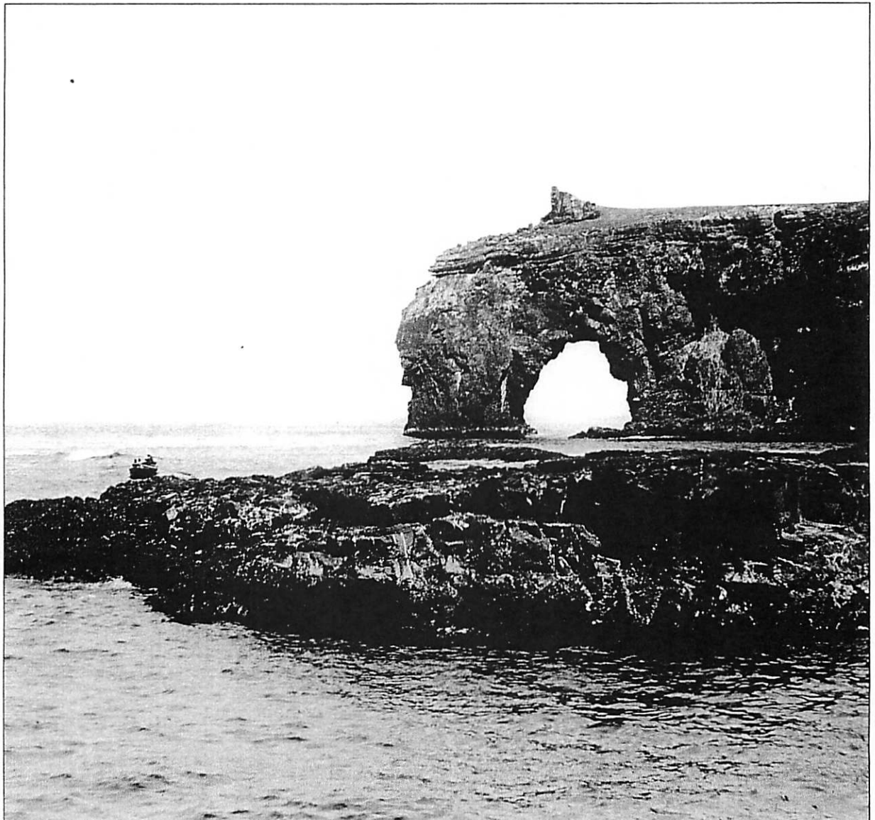
The Horn, Papa Stour